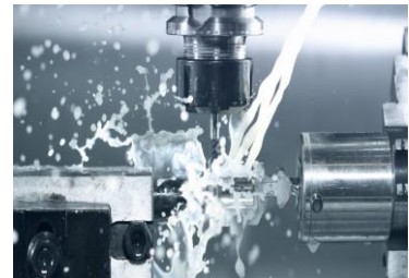
Soluble cutting oil with EASTTO CONKUT emulsifiers.