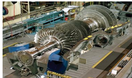
Used for lubrication of turbines

PERFORMANCE LEVEL: Meet BIS – 1012 - 1987 (Reaffirmed 1993), Meet General Electric GEK 27070 Specification, KWU (Siemens) W. Germany.