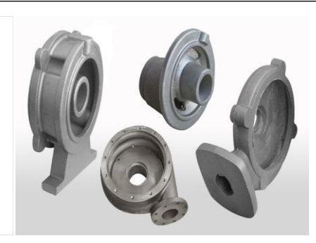
Rust Preventives gives better protective coating films.